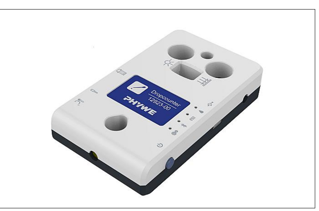
Fig. 1: 12923-00 Cobra SMARTsense Drop counter